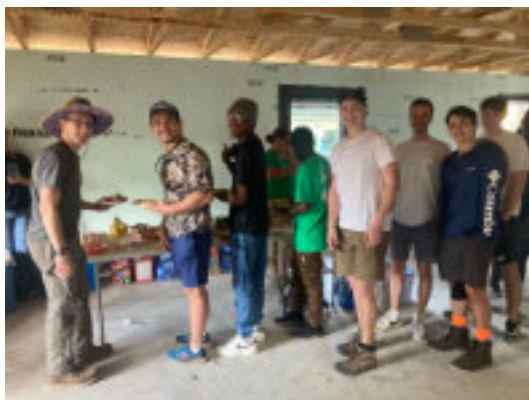
Some of the young men from Alfred University.