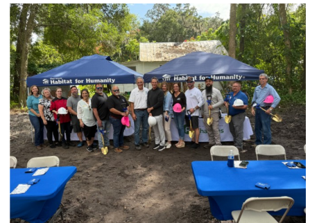
Representatives from the proud Sponsors of WVHH veterans build.