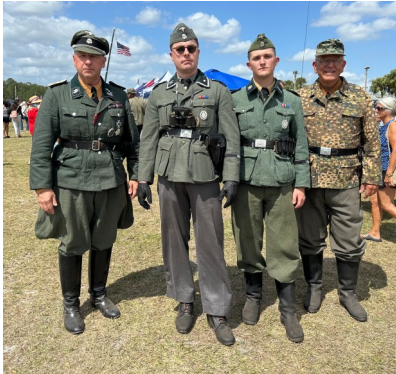
Reenactors dressed in German WW II uniforms. Volusia Valor Days.