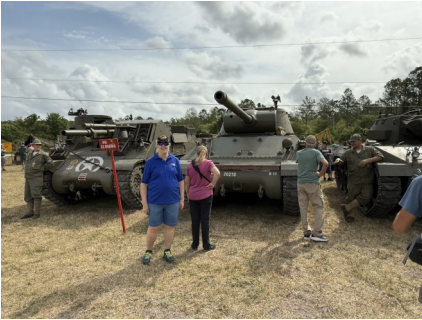
WW II armored vehicles on display at the Volusia Valor Days help at the Volusia County Fair Grounds.