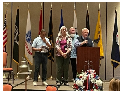
2023 conference attendees about the plans for the 2024 FCoC Convention in Daytona Beach.

A Memorial Service was held on 20 May for the members who passed away during the past year.