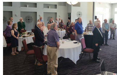
The May meeting concluded with the singing of God Bless America.